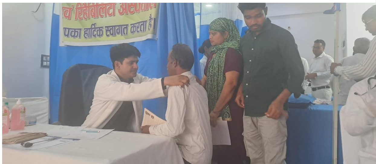
Exercise regime given by Physiotherapy Students from faculty