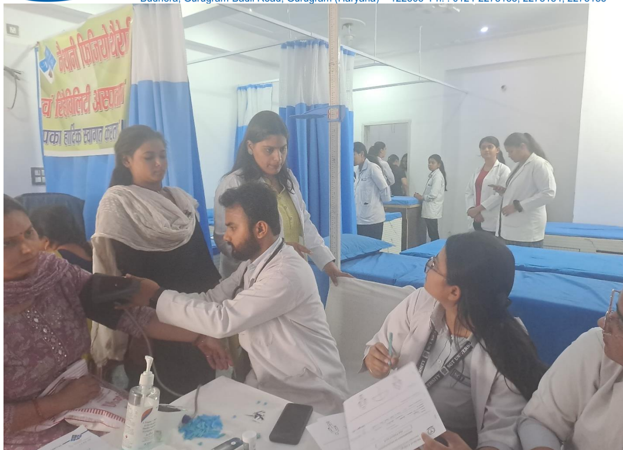
Assessment performed by Physiotherapy Students from faculty

Budhera, Gurugram-Badli Road, Gurugram (Haryana) – 122505 Ph. : 0124-2278183, 2278184, 2278185