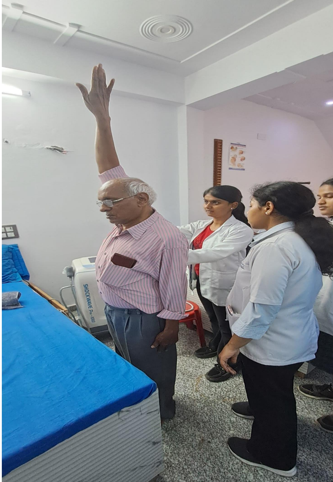
Patient examination performed by physiotherapy students under supervision of senior consultant

Budhera, Gurugram-Badli Road, Gurugram (Haryana) – 122505 Ph. : 0124-2278183, 2278184, 2278185