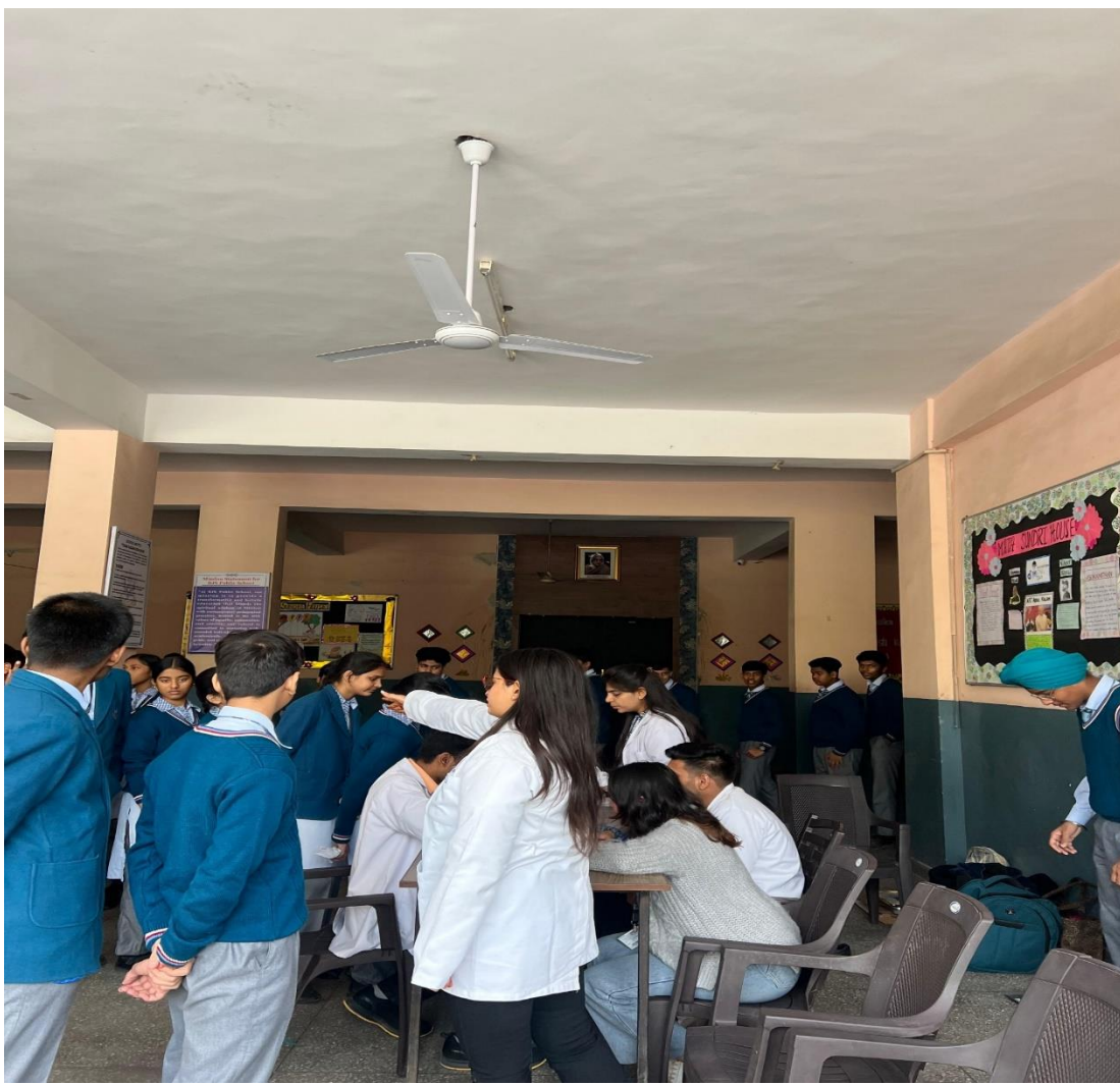
Students of MPT calculating the data of BMI of