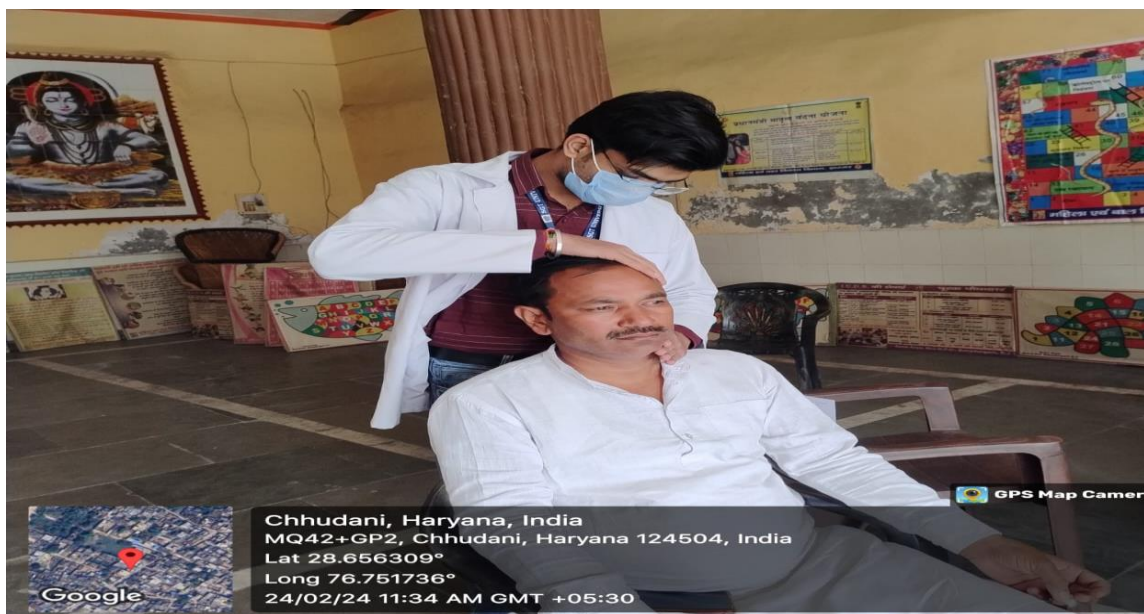
1. Treatment ongoing with male physiotherapy students