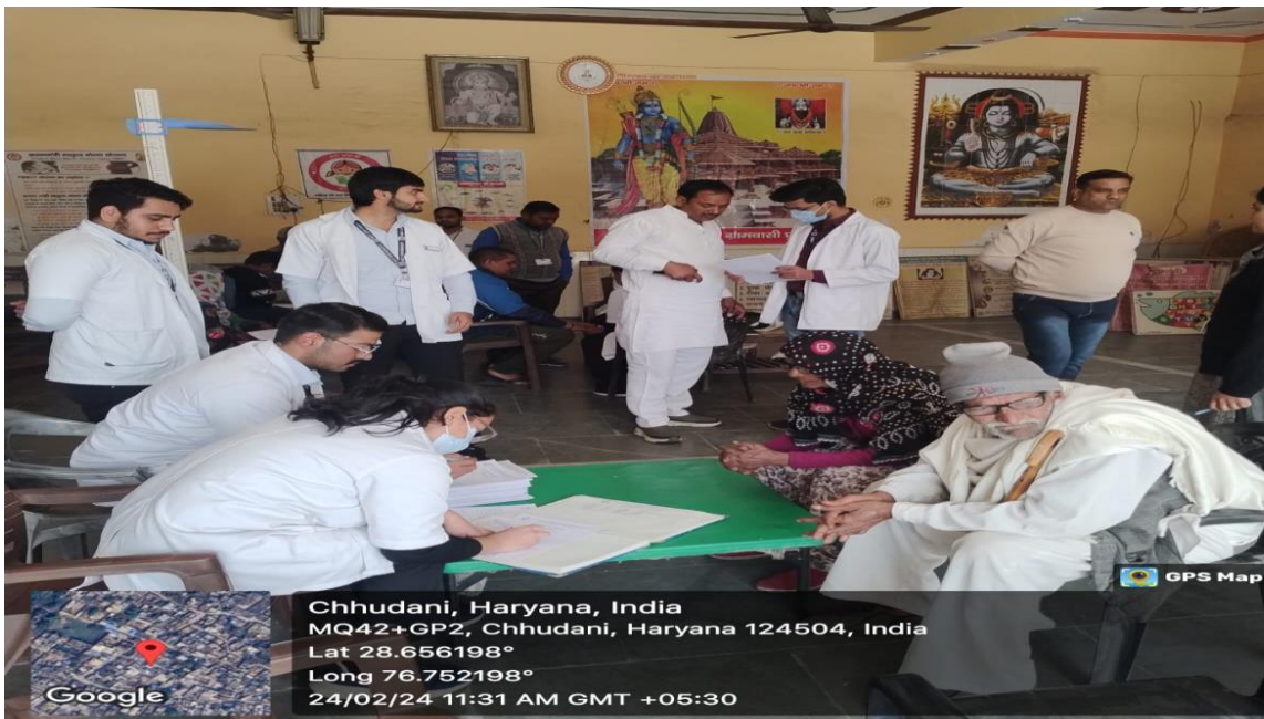
Patient registration for check up