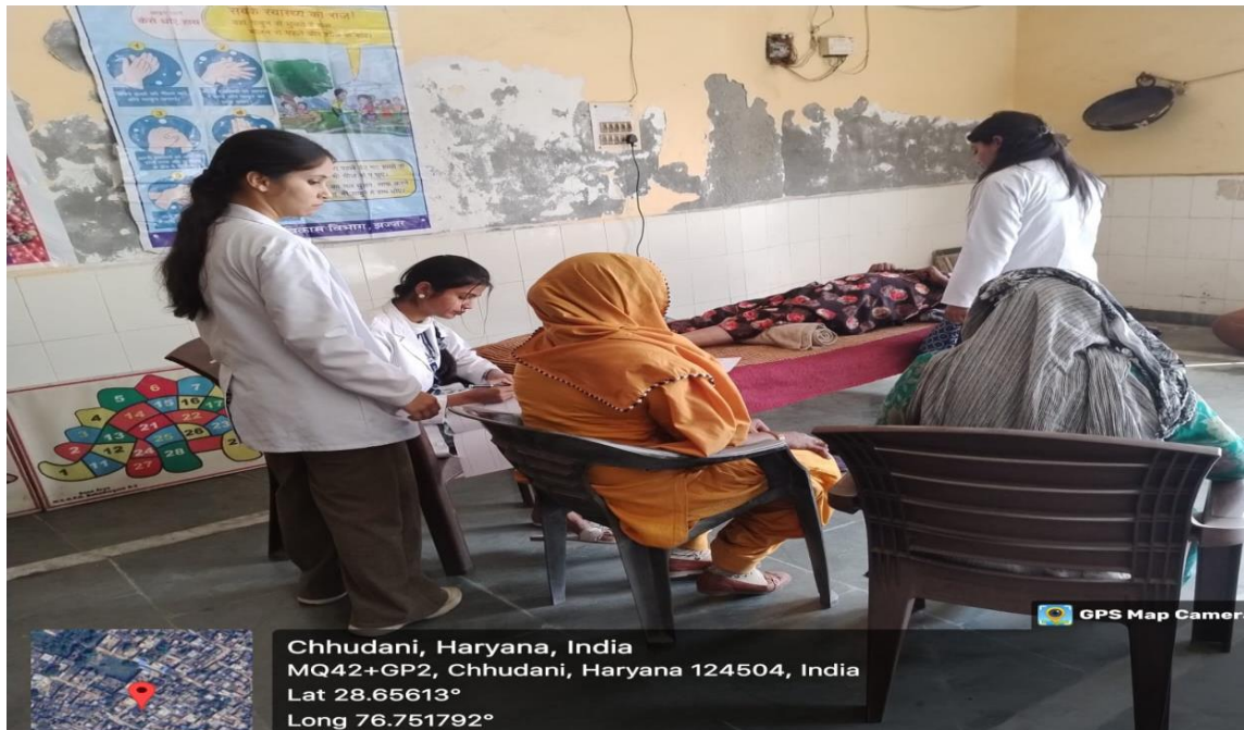
Treatment ongoing with female physiotherapy