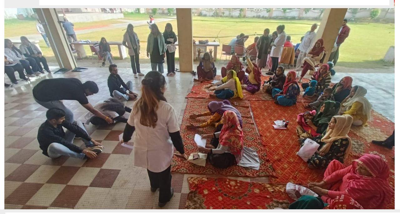
<u>Team physiotherapy instructing to follow the exercise regime for better Menstrual</u> <u>Health</u>