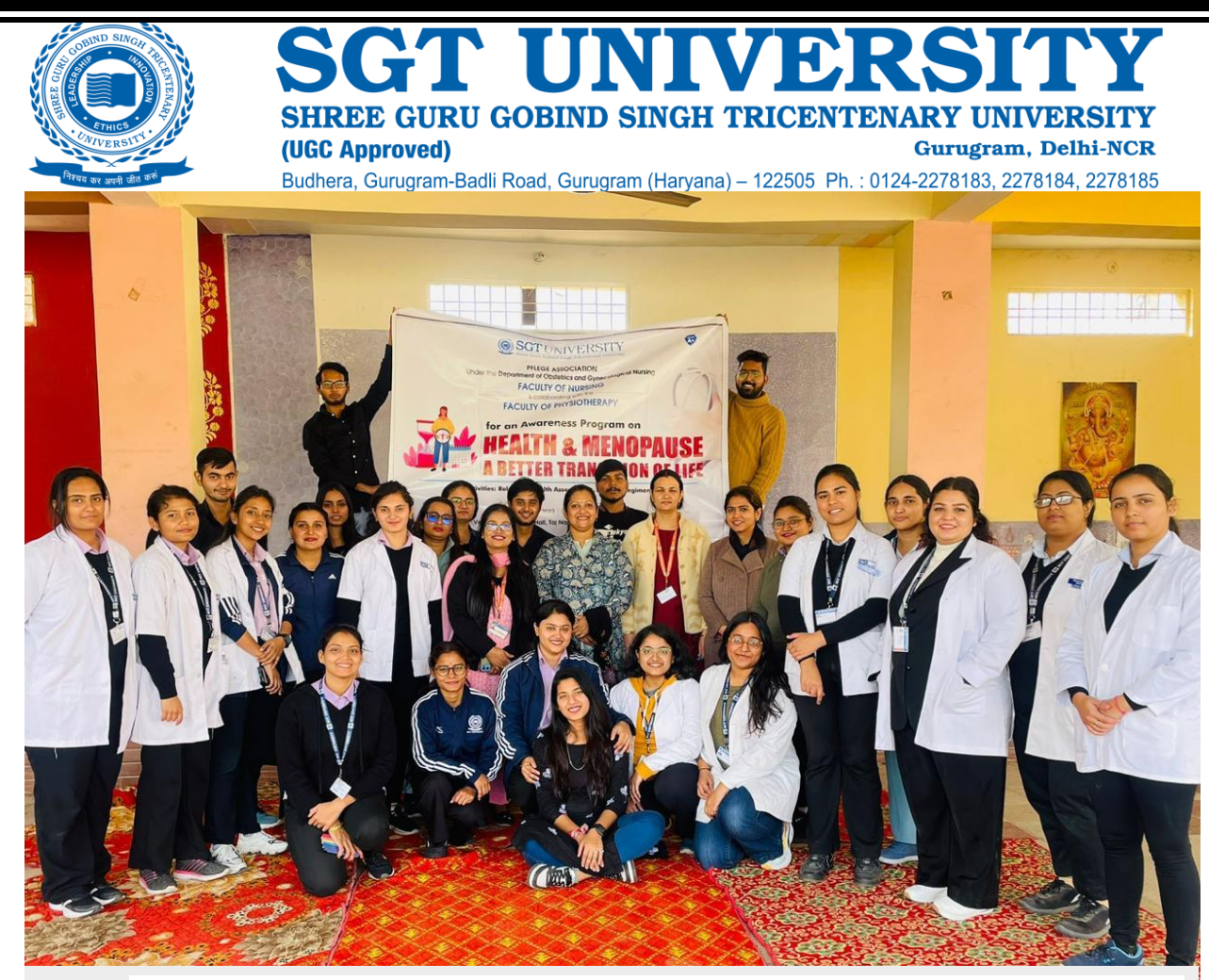
Team of Faculty of Physiotherapy SGT University, Gurugram