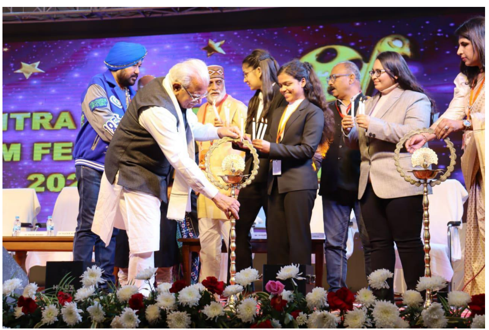
FMMT Students with Hon'ble CM of Haryana