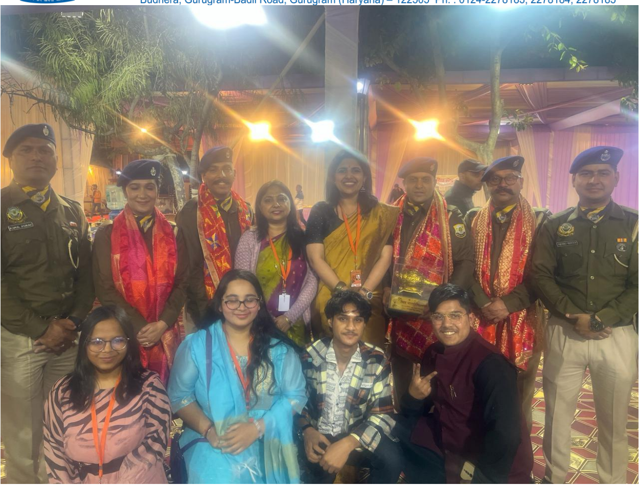
FMMT Students with Himachal Police Band Team