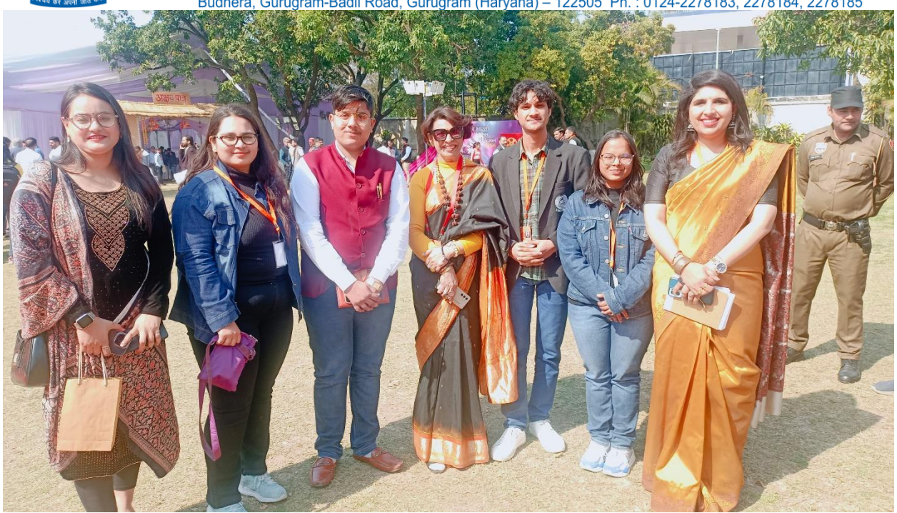
Students with Chairperson of Haryana State Commission for Women