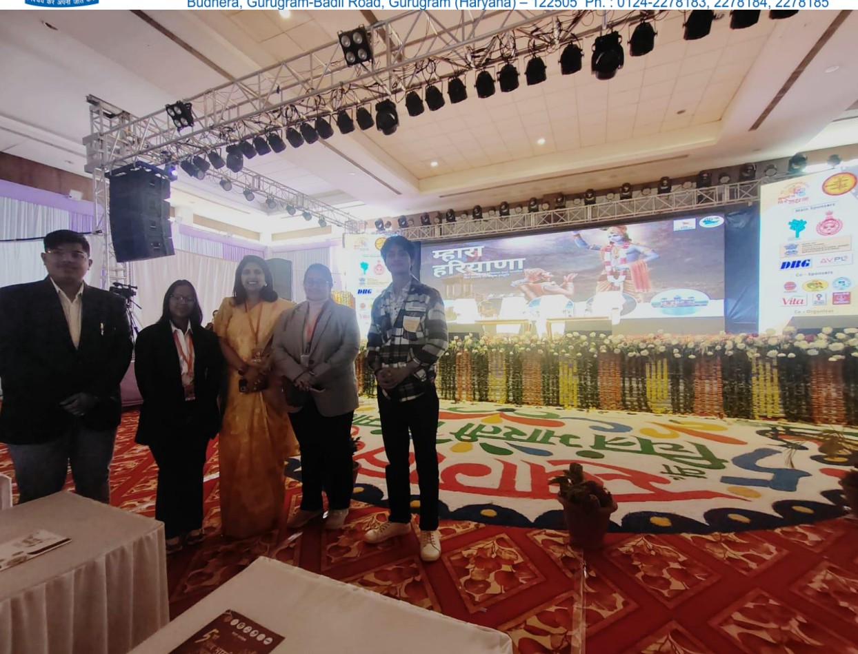
National Film Festival Audi 1