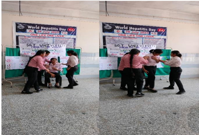
Roleplay on Prevention and Management of asthma