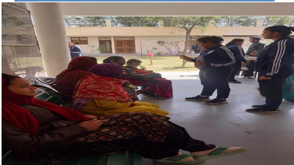
MSc Student's given the health awareness regarding the reproductive health