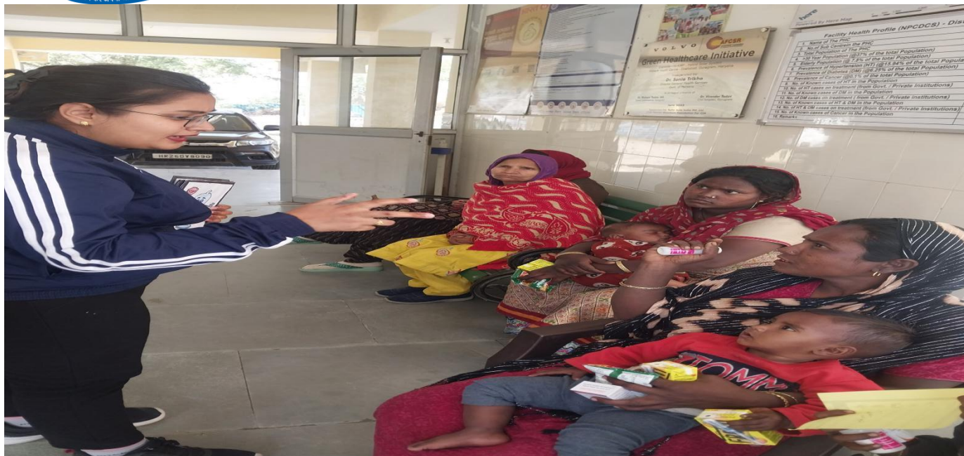
Students given health awareness on sexual reproductive health