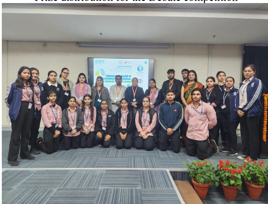
Group Photograph of The Organizing Team and Students of Wellbeing Club Under Community Health Nursing Department, Faculty Of Nursing, SGT University with the Speaker.