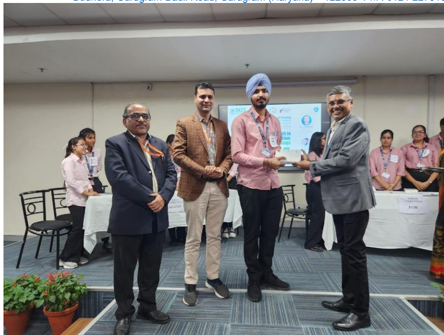
Prize distribution for the Debate competition

Budhera, Gurugram-Badli Road, Gurugram (Haryana) – 122505 Ph. : 0124-2278183, 2278184, 2278185