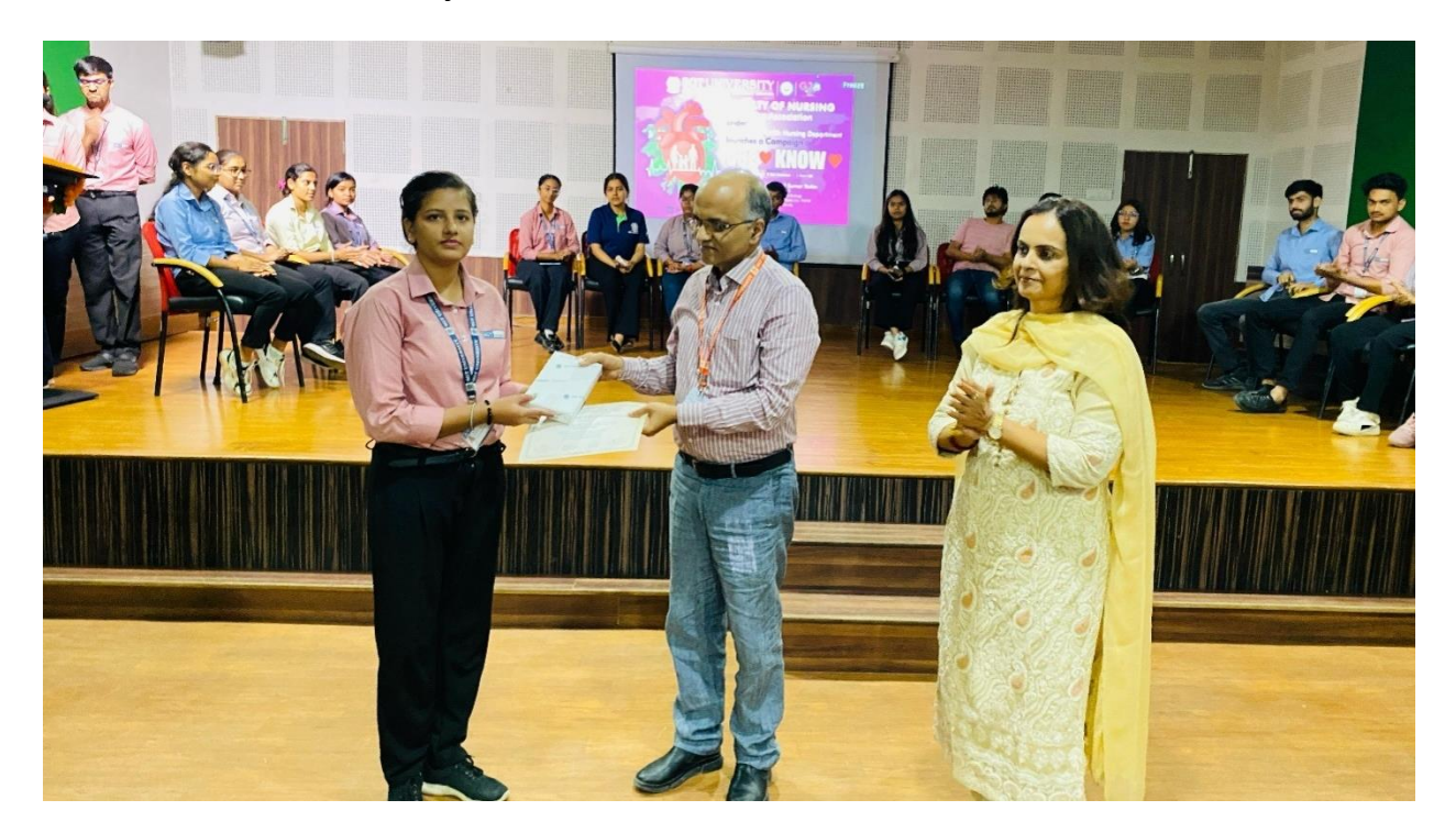
Prize distribution for the winnerof quiz and Poster competition